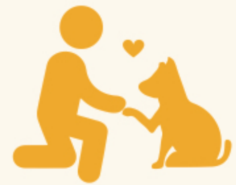
Ending cat and dog eating