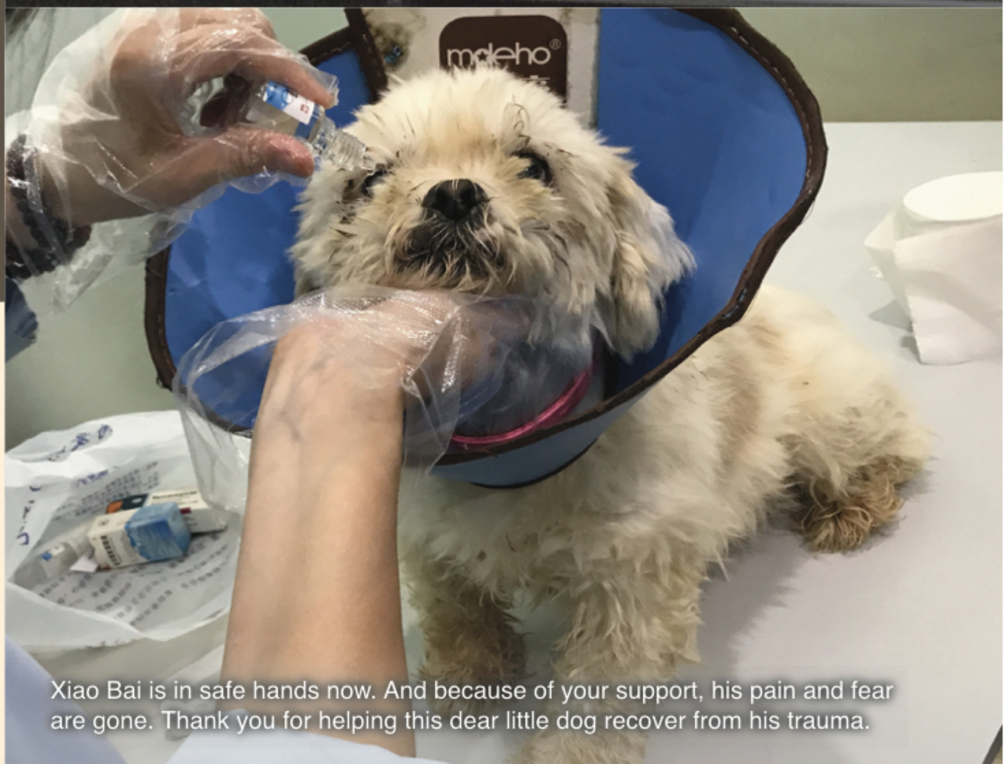
Xiao Bai is in safe hands now. And because of your support, his pain and fear are gone. Thank you for helping this dear little dog recover from his trauma.

Imagine returning home one day to find the faithful companion you've raised, loved and been loved by for years is gone. That's what Xiao Bai's family has suffered. And from this confused little dog's perspective, it's even more heart breaking.