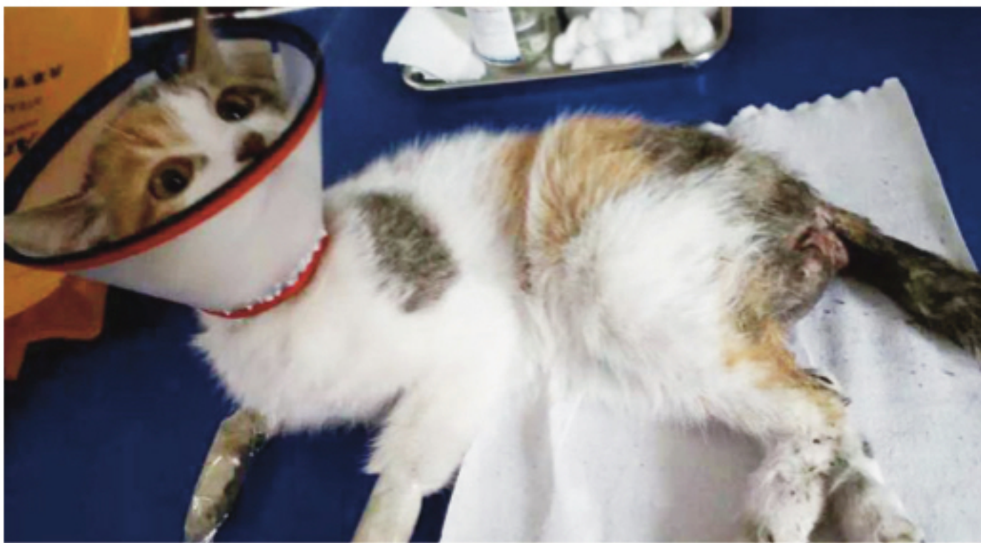
Hungry and paralysed, poor little Xiaoxi wouldn't have lasted much longer on the streets. Now she has the care she needs...

These volunteers at the Harbin Small Animal Protection Centre are among many Chinese animal welfare groups that receive vital support from Animals Asia through your kind gifts. We work with over 120 of these groups offering funding, advice and training.