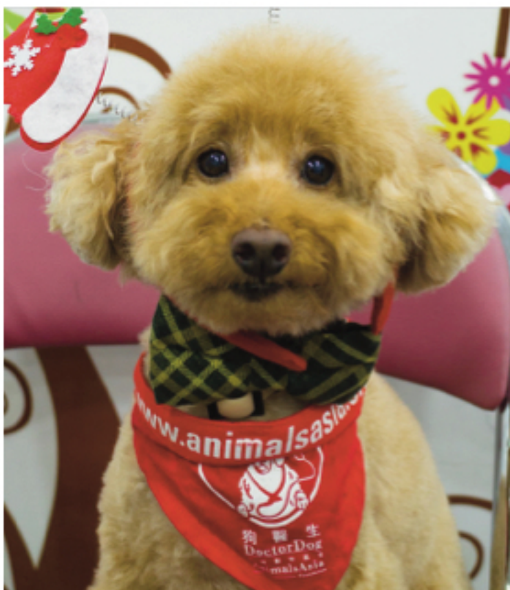
Good boy Dr Oscar... you're healing hearts and lifting spirits more than you could ever know.

Later we received a card from the patient with a message that's sure to bring a tear to your eye... but warm your heart too.