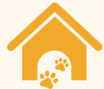
Creating better shelters