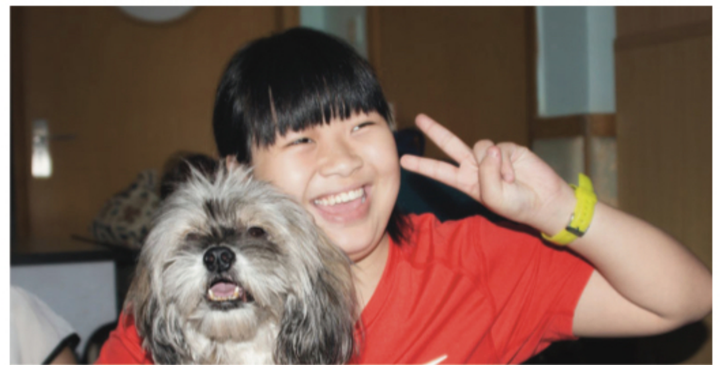
Friendly little Heimei is still as bright and eager for cuddles as she was when she started as a Dr Dog in 2006.